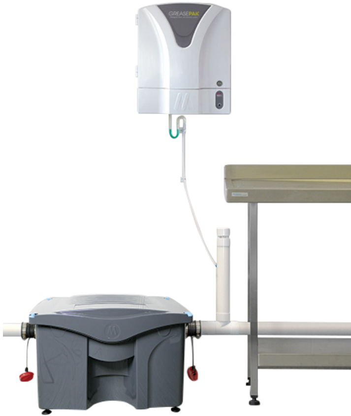
BioCeptor F.I.T Unit: