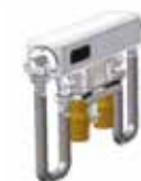
Sink Bracket (1x) Fixes to dishwasher tabling