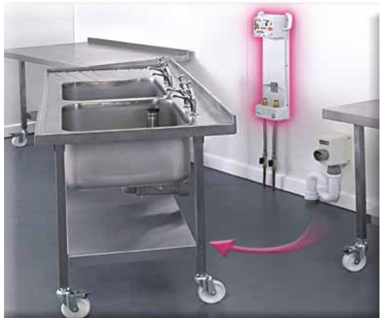
Shown: QuickLink installed with sink moved from wall and disconnected from services.

The QuickLink systems allow equipment, normally restricted in movement through mechanical services connections, to be totally and safely mobilised through the innovative quick disconnect system. Thus, items such as Sinks, Dishwash Systems, Waste Disposal Units and beverage units can now be successfully mobilised quickly and simply, without the caterer needing the assistance of any special tools or the attendance of an engineer.