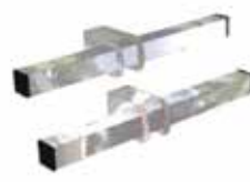
Wall Buffers (2x) Bolt to sink legs to eliminate twisting.