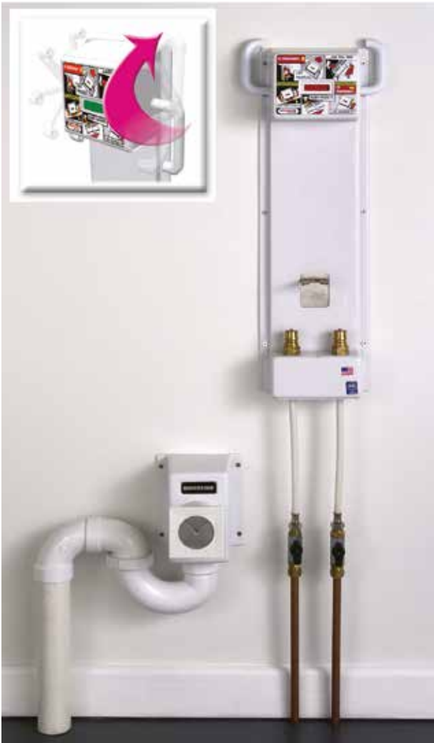
Shown: QuickLink Wallplate and Standard Drain Kit. Inset: Wallplate levers in motion to demonstrate operation.